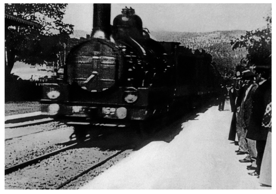
Figure 6. Film still from Lumière Brothers' L'arrivée d'un train en gare de La Ciotat (1895).

conceived of in opposition to anatomy, the artificial is not to be understood as antithetical to the natural. Technical prostheses are a natural extension of the human perception and action. The human beings are naturally technical. This is the perimeter that circumscribes the possibility of a history and theory of self-negating images: namely, the possibility of an-iconology .