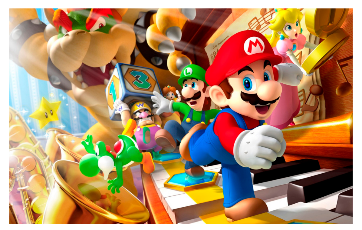
Figure 2. Super Mario, character created in 1985 and developed by Nintendo.

Immersivity and interactivity are only two of the many aspects that an-iconology as a methodological approach addressing self-negating images must take into consideration. A major question concerns the necessary and sufficient conditions in order to have an-iconic images. The conditions posed by Calleja seem very restrictive: they are basically satisfied only by certain video-games in which the system's capacity to recognize you within itself is combined with interactivity [21]. Calleja excludes from the necessary conditions the illusionistic and hyper-realistic effect (I can incorporate myself into Super Mario as well (Figure 2), provided that interactivity is ensured).