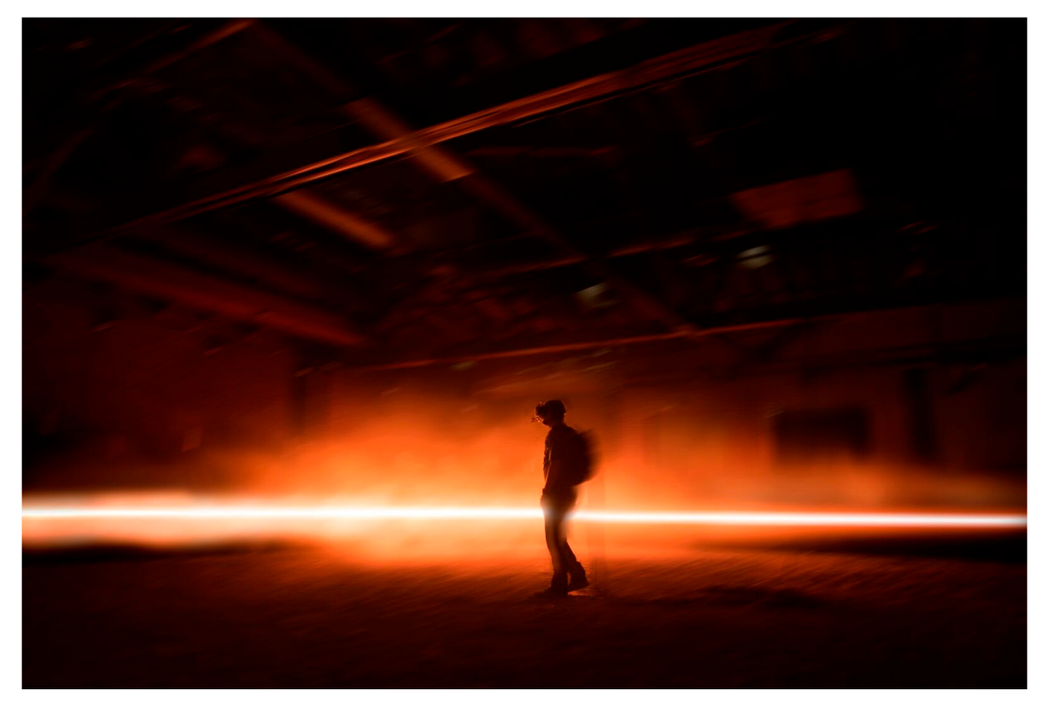
Figure 1. Carne y Arena – A user in the experience, 2017.

I said: "if you want to experience it", rather than to "see it". "Seeing" is already improper for a movie: you watch it and hear it, it is an audio-visual medium. But here the sand under your feet and the wind add a tactile dimension. And in certain moments you even imagine the odours: of the desert, of the bushes, of the wild animals. Of the sweat produced by effort and fear. Of the bad breath of fugitives and policemen who did not sleep. There are actually no smells in Carne y Arena . Soon, however, we will perceive them in similar environments. The endeavours to implement multisensory