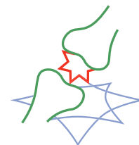
ORTHOPAEDICS/ PAIN MEDICINE/ RHEUMATOLOGY